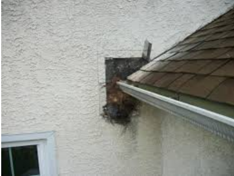
More damage from water running off the roof and towards the wall.