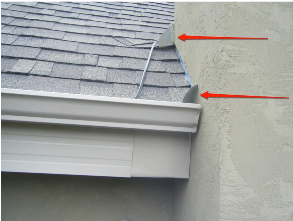
The little metal flashing that direct water away from the wall where it interfaces with the roof Edge. The red arrows point to kick-out flashings.