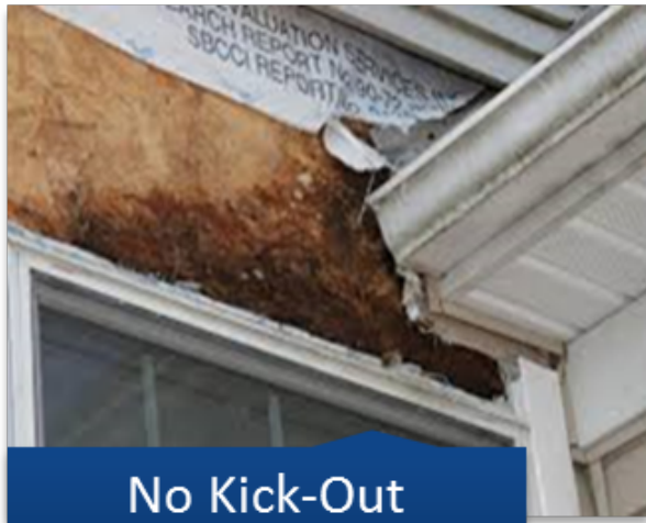
No Kick-Out Flashing